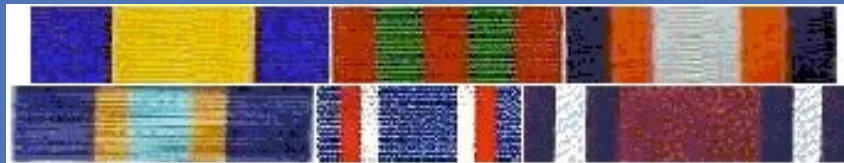
Six Ribbon Arrangement

All Cadet medals are worn over your right breast pocket, under the name-tag. It is illegal in Canada to wear medals not earned by oneself; even if they were earned by relatives. Medals are worn in order of precedence; with the highest ranking medals worn closest to the centre of the chest and above other medals. Cadet medals are worn in rows of three. In exceptional circumstances, cadets can also receive medals that are part of the Official Canadian Medals & Honours System. This is subject to the CO's approval, but is not by any means normally done.